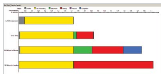
Predict the impact of infrastructure changes on end-to-end response time.